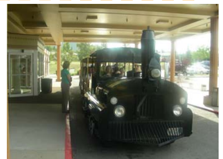
All aboard! Monday evening's transportation to the Montana Historical Society was provided by the Helena Tour Train.