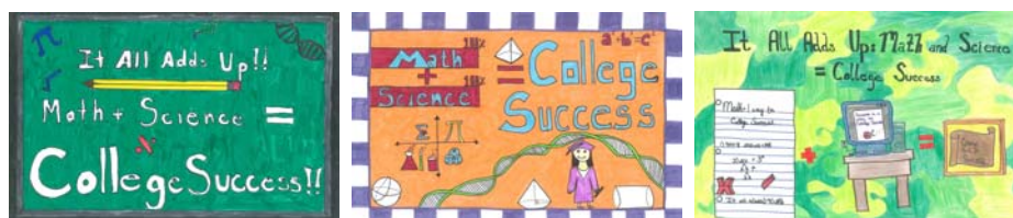
2008-2009 poster contest entries